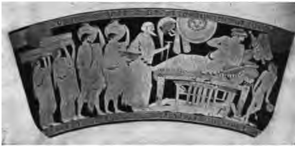
Fig. 90. Priam ransoming Hector's Body.

throwing, and other contests, and Achilles offered splendid prizes, and all the heroes entered the lists. When this was over, Zeus sent Iris to Priam to bid him go to Achilles' tent to ransom the body of his son. As Priam went in his chariot, Hermes met him and guided him safely through the sleeping guards and brought him to Achilles' tent. And Achilles, who had been warned by Thetis that this was Zeus's will, re-